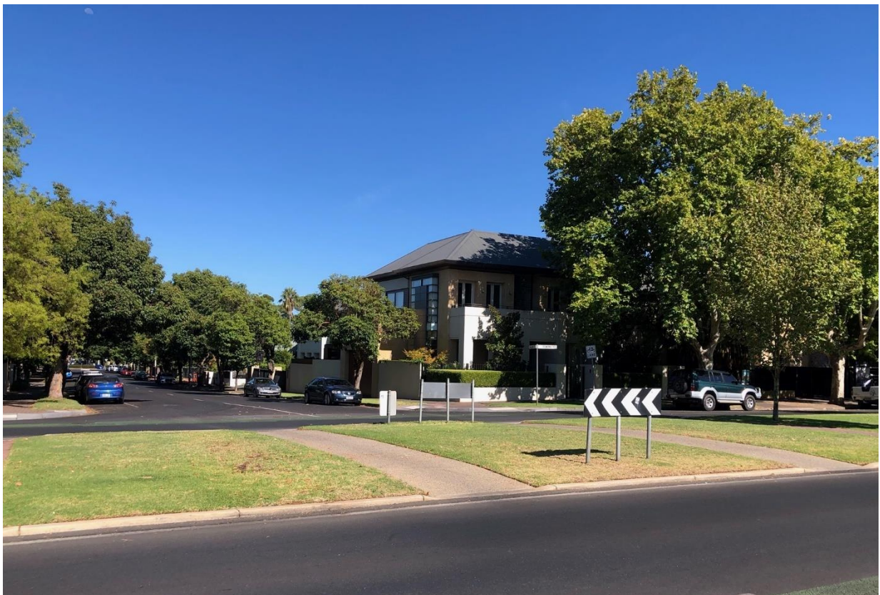
Figure 5: Osmond Terrace roadway median at the junction of William Street, Norwood, looking east