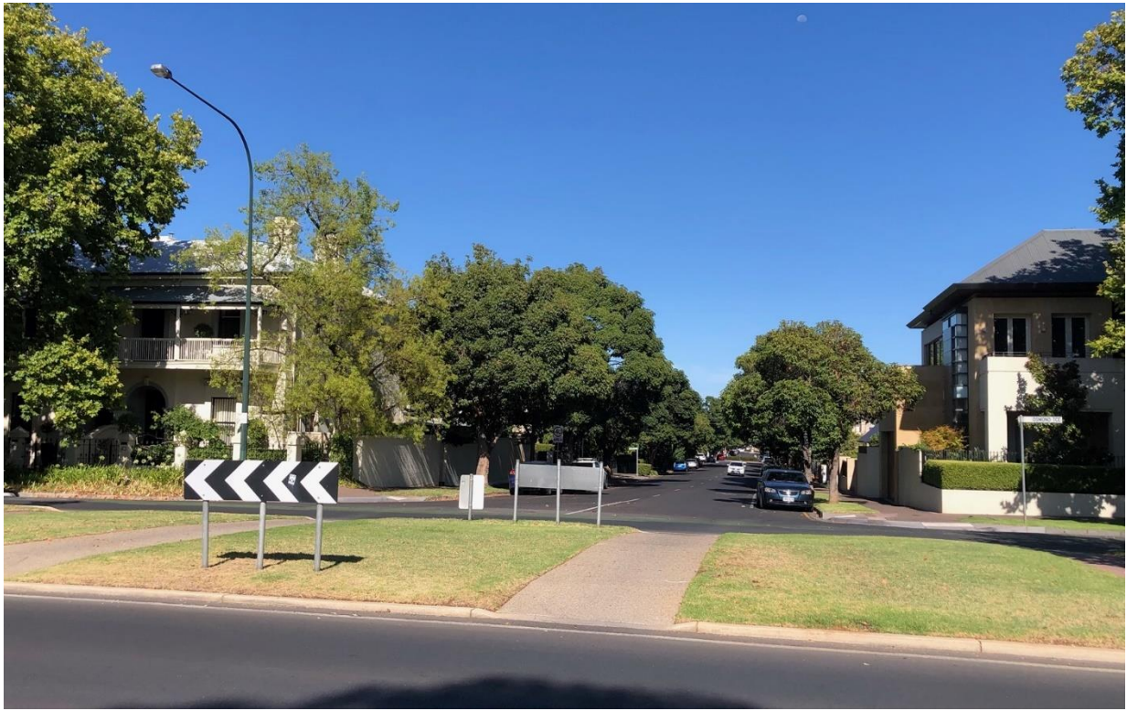
Figure 4: Osmond Terrace roadway median at the junction of William Street, Norwood, looking west