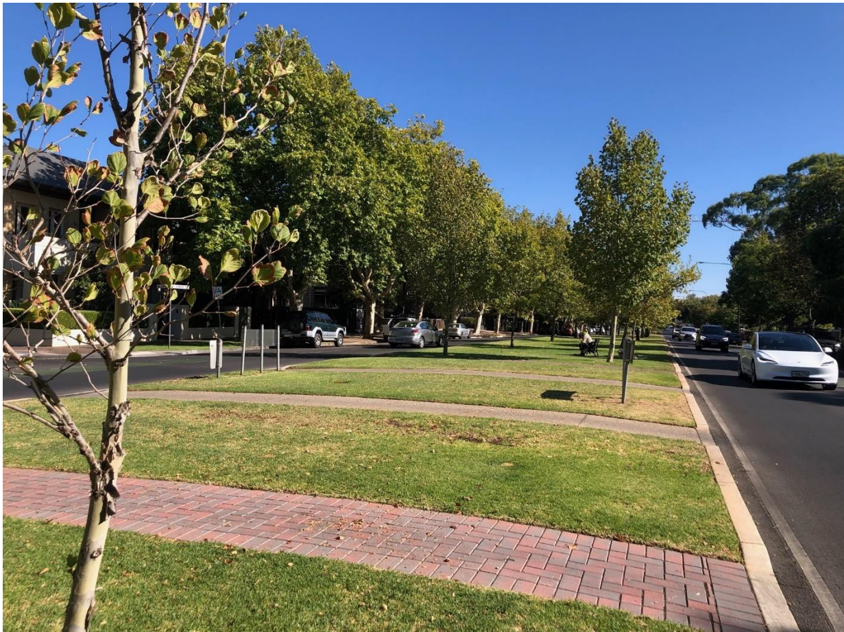
Figure 3: Osmond Terrace roadway median at the junction of William Street, Norwood, looking north