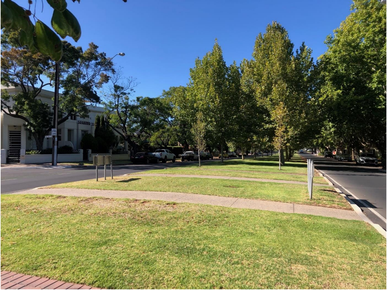
Figure 1: Osmond Terrace roadway median at the junction of William Street, Norwood, looking south