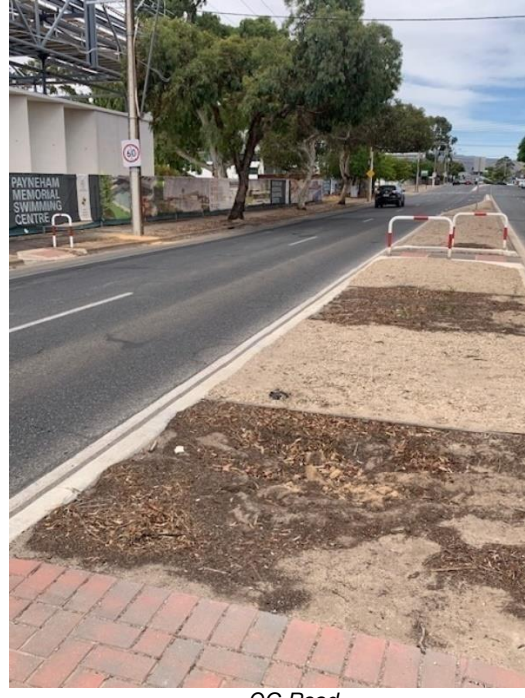
OG Road (between Turner St and Payneham Rd looking south)

The Department will not bear any costs associated with the planting and maintenance of any trees or other vegetation proposed and installed by the Council. Delivery of landscaping work and maintenance on the Department's arterial roads will require workzone traffic management, and be subject to time restrictions, thereby impacting costs. The following are images of the OG Road median.