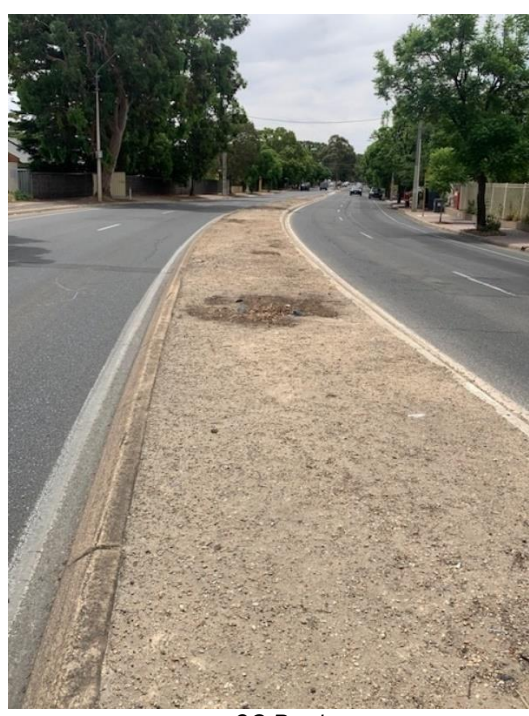
OG Road (between Turner St and Pitt St looking north)