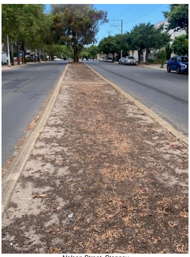
Nelson Street, Stepney (between Union Street and Magill Road looking south)

Over the last ten years, the Department has removed several trees that were planted in the OG Road median for safety and maintenance reasons. The OG Road median now has few remaining trees. Newly planted trees will require regular irrigation for the first few years during the summer to become established. Manual watering via a truck may be expensive due to time restrictions for maintenance. Therefore, investment in a drip irrigation system should also be considered for the OG Road median if new trees are approved to be planted. The following is an image of the Nelson Street median.