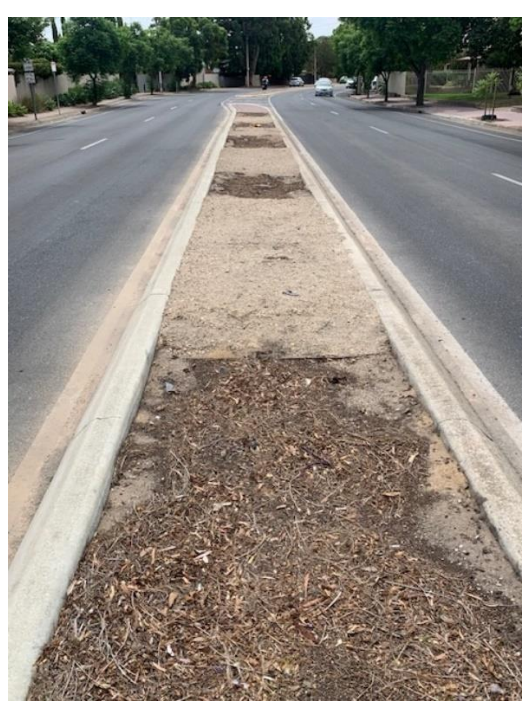
OG Road (between Turner St and Pitt St looking north)