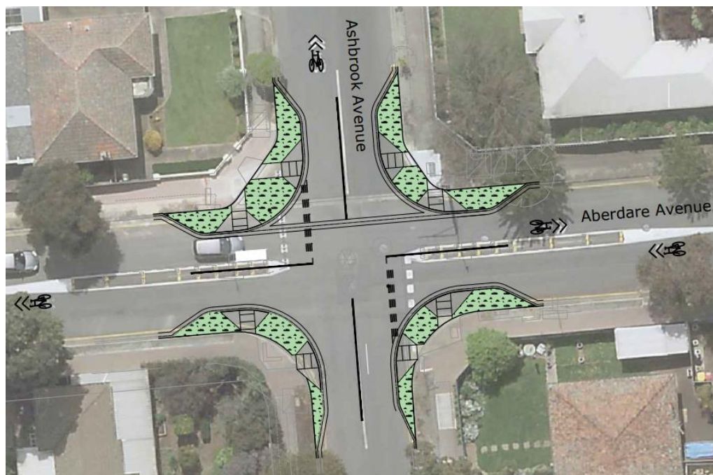
Aberdare Avenue and Ashbrook Avenue