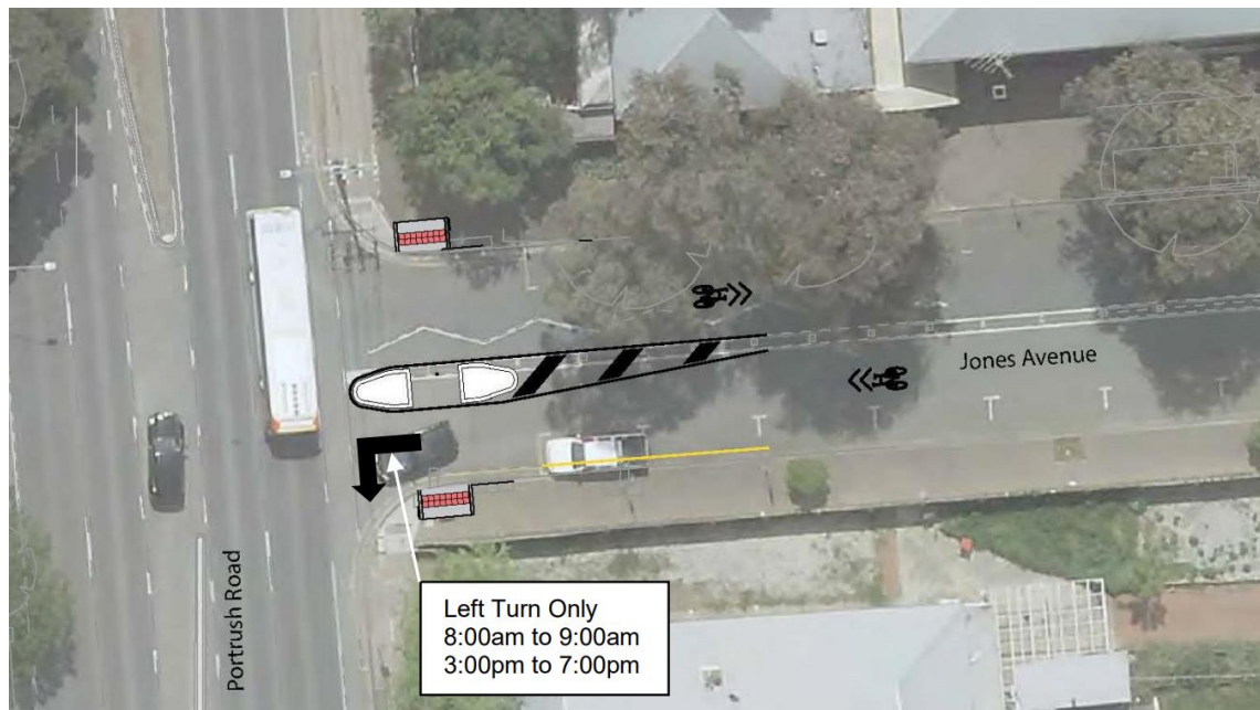
Portrush Road and Jones Avenue Junction