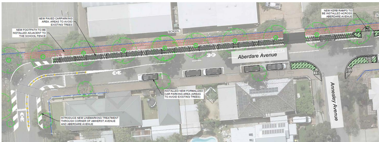
Aberdare Avenue: Amherst Avenue to Annesley Avenue