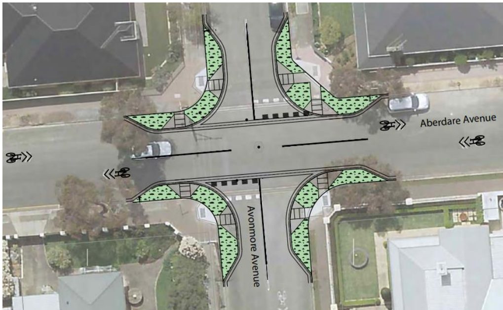
Aberdare Avenue and Avonmore Avenue