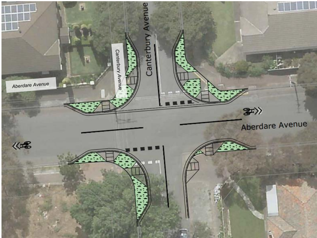
Aberdare Avenue and Canterbury Avenue