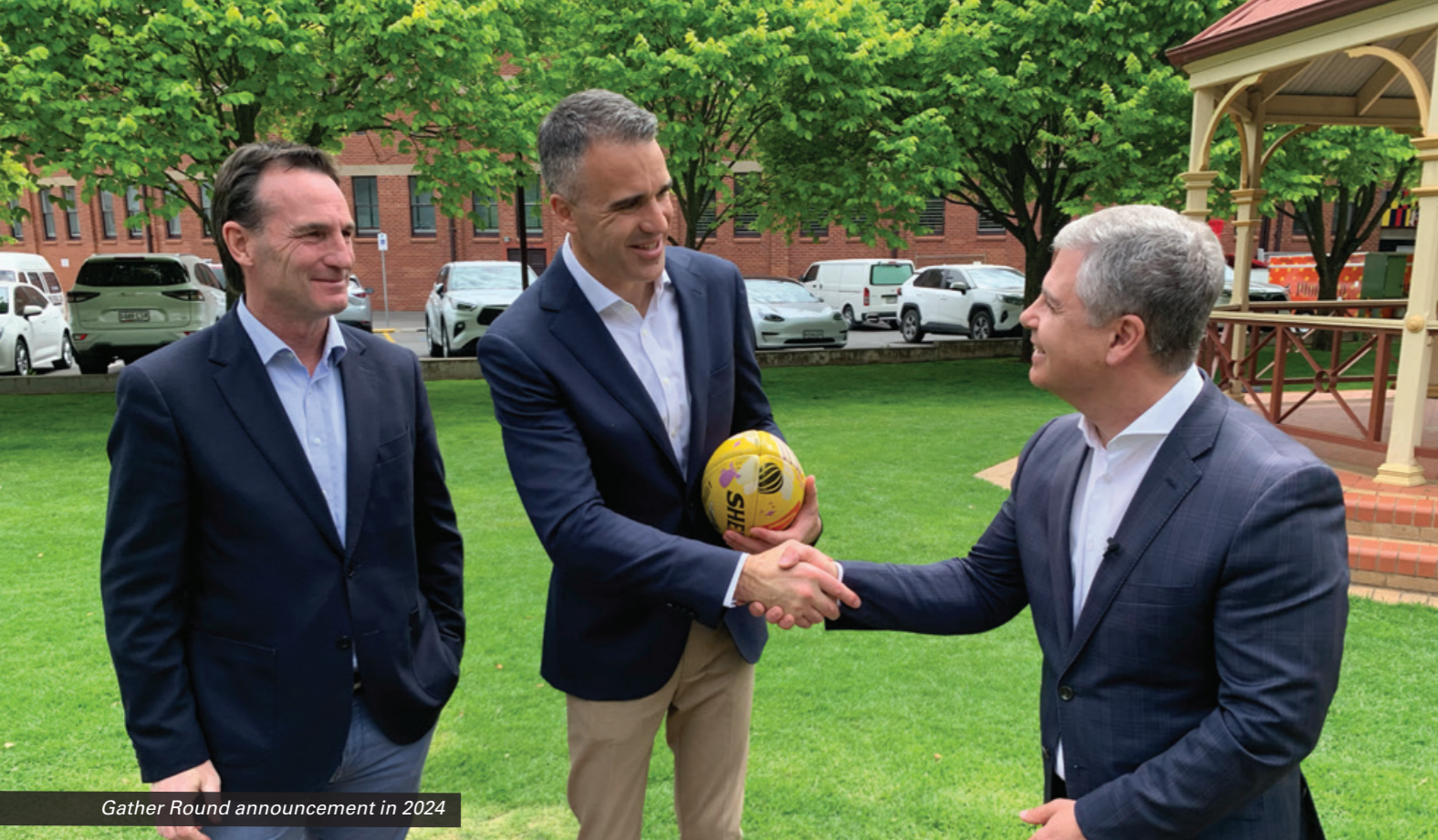
Gather Round announcement in 2024