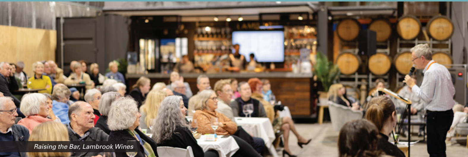
Raising the Bar, Lambrook Wines

A dynamic and thriving centre for business and services