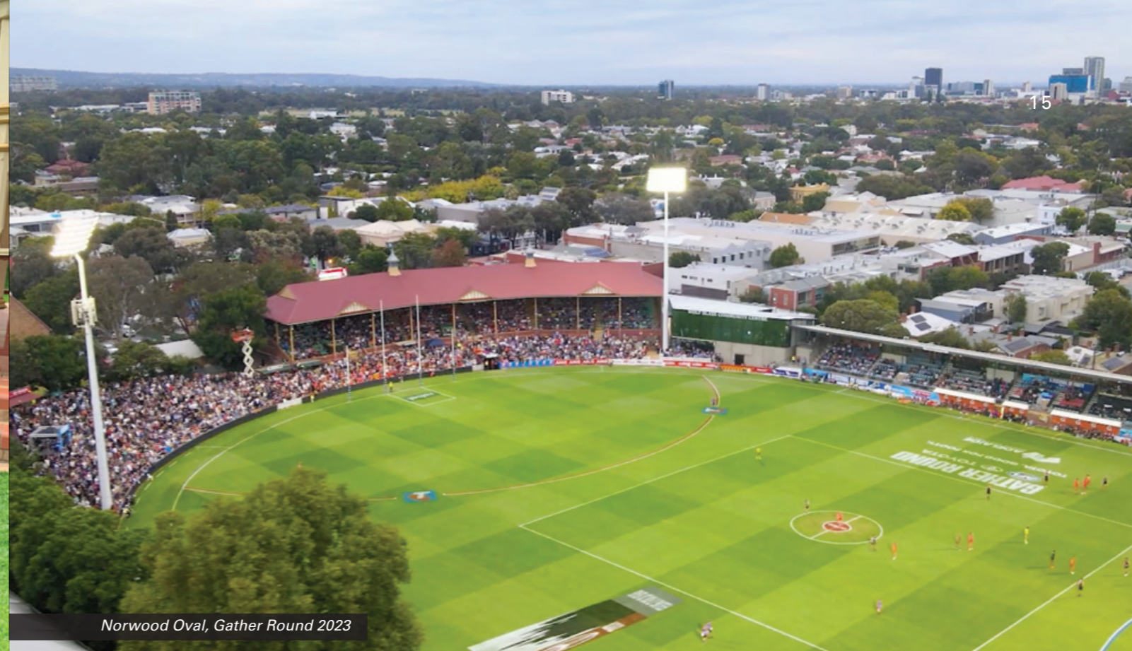
Norwood Oval, Gather Round 2023