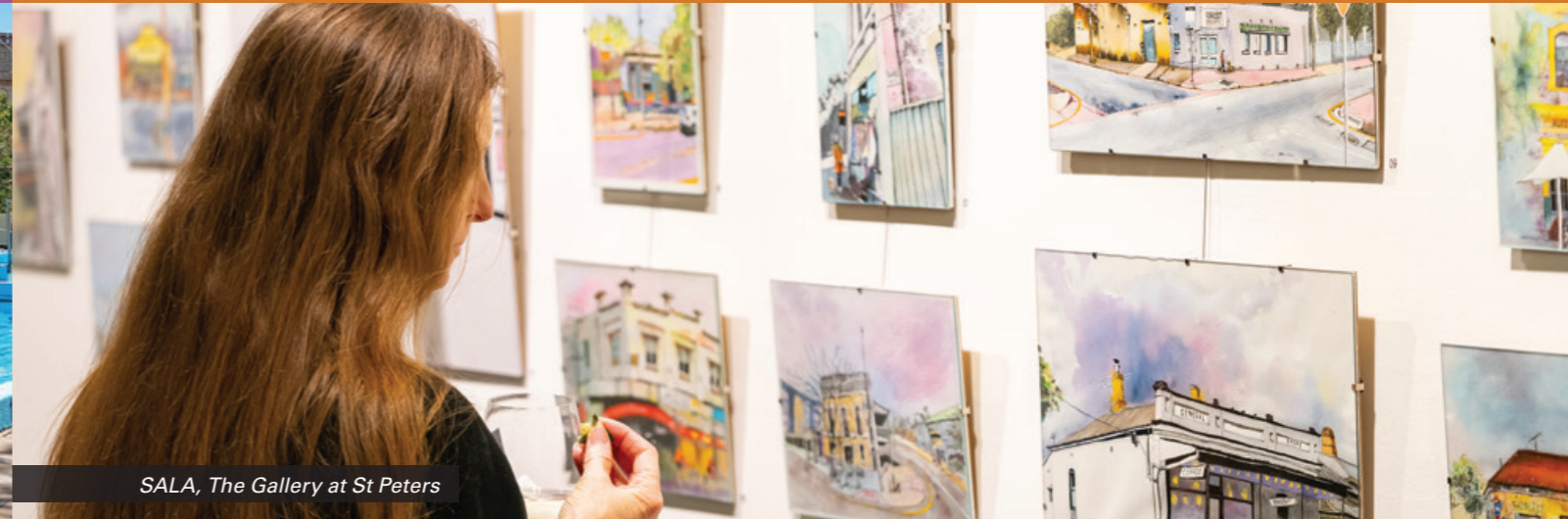
SALA, The Gallery at St Peters

A culturally rich and diverse city, with a strong identity, history and sense of place