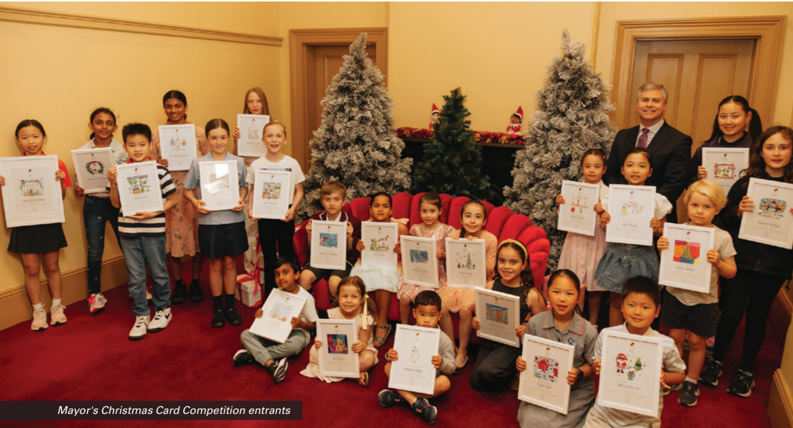
Mayor's Christmas Card Competition entrants

The City of Norwood Payneham & St Peters has officially welcomed the holiday season with the 14th Mayor's Christmas Card Competition, an event that continues to captivate the hearts and minds of our local community's youngest artists.