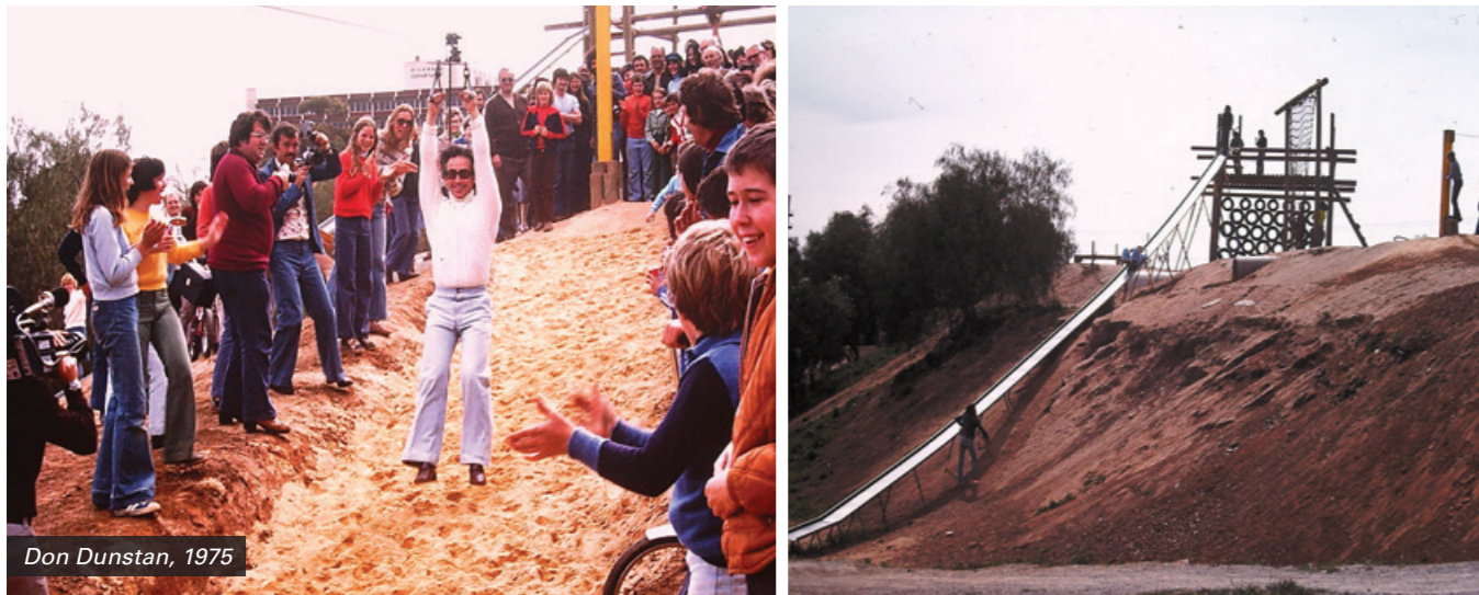
Don Dunstan, 1975