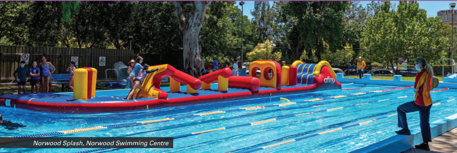
Norwood Splash, Norwood Swimming Centre

An inclusive, connected, accessible and friendly community