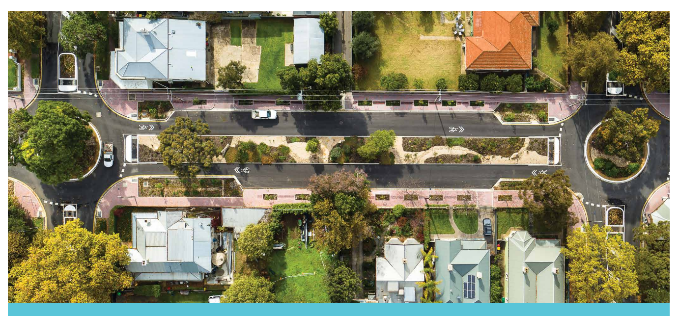
Aerial view of the St Peters Street Streetscape Upgrade

In just a few months, the community will see the final results of the Council's redevelopment of Dunstan Adventure Playground and Cruickshank Reserve, bringing joy to children, sport lovers and the wider community.